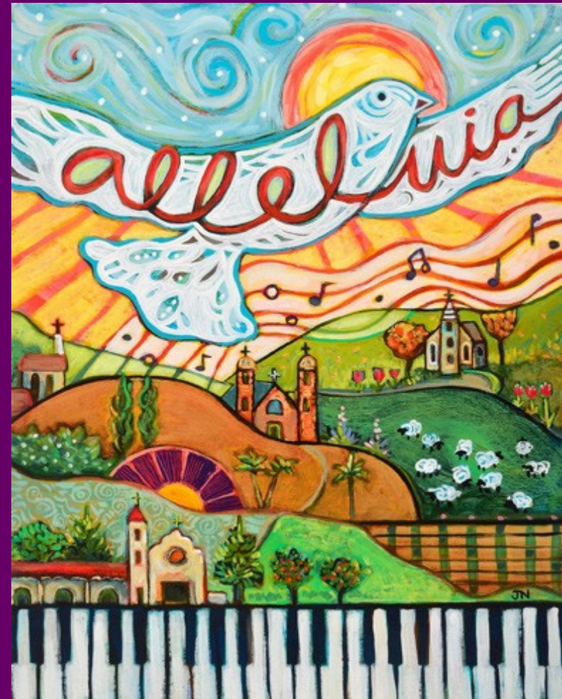
Three Sonnets on the Temptations of Christ