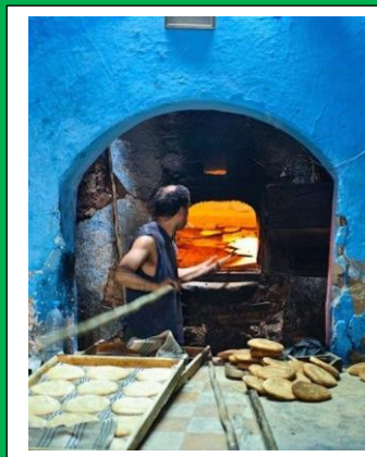
Community Oven Baking in Morocco