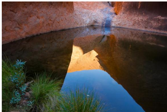
Water at Uluru