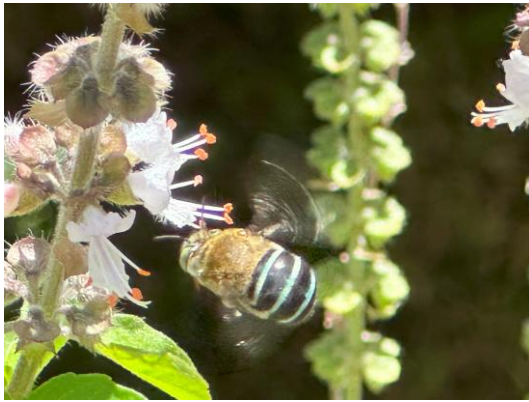
Blue Banded Bee Australian Native