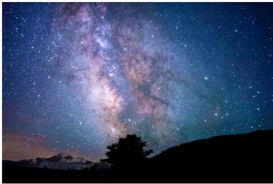
The Milky Way – our galaxy