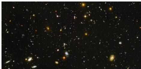
Not stars but galaxies!