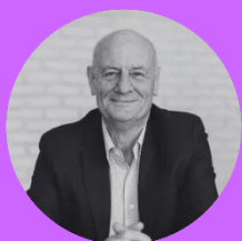
REV TIM COSTELLO

It is this presence that gives us hope. Not hope grounded in an apocalyptic intervention, but in the sure knowledge that God is with us through it all.