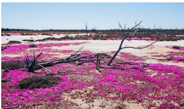
Wildflowers in WA desert

The Storehouse will be closed from 22 nd December 2025 till 21 st January 2026 (first food distribution day)