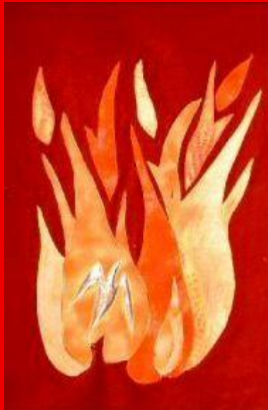
Pentecost Banner, St Michael's Bartley Green

their own way, another four evangelists. In that context I was very struck by the way Scripture expresses the presence of the Holy Spirit through the three most dynamic of the four elements, the air, ( a mighty rushing wind, but also the breath of the spirit) water, (the waters of baptism, the river of life, the fountain springing up to eternal life promised by Jesus) and of course fire, the tongues of flame at Pentecost. Three out of four ain't bad, but I was wondering, where is the fourth? Where is earth? And then I realised that we ourselves are earth, the 'Adam' made of the red clay, and we become living beings, fully alive, when the Holy Spirit, clothed in the three other elements comes upon us and becomes a part of who we are. So something of that reflection is embodied in the sonnet.